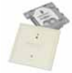
FW-MMAUS Wireless Monitor Module