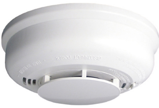
2012/24AUSI - Photoelectric Smoke Alarm with Integral Temp-3 Sounder